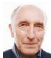
Vaclav Smil Distinguished Professor Emeritus, University of Manitoba Canada