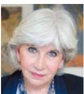
Laurence Tubiana CEO, European Climate Foundation; Chair of the Board of Governors, French Development Agency (AFD); Professor, Sciences Po Paris France