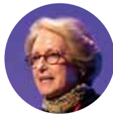
Thelma Krug Vice-Chair of the Intergovernmental Panel on Climate Change (IPCC)