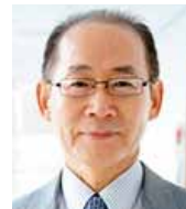
Hoesung Lee Chair of the Intergovernmental Panel on Climate Change (IPCC) Endowed Chair Professor, Graduate School of Energy and Environment, Korea University Republic of Korea