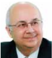
Ismail Serageldin Founding Director Emeritus, Library of Alexandria Egypt