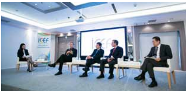
Small Modular Reactor for Nuclear