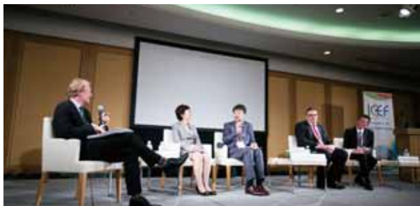
Decarbonisation by Industrial Sector