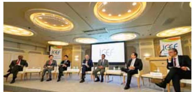
Renewable Microgrid and Energy Access