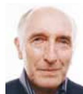
Vaclav Smil Distinguished Professor Emeritus, University of Manitoba Canada