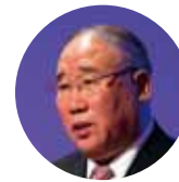
Xie Zhenhua Special Representative on Climate Change Affairs, China