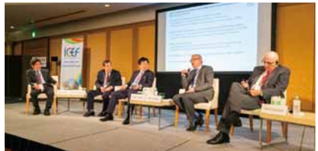
Growing Renewable Energy and Grid Stabilisation