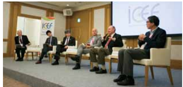
IoT for CO 2 Reduction