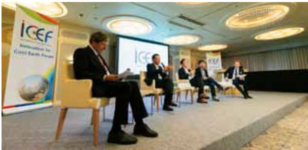
Fintech for Climate Change