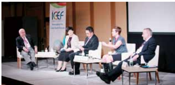
SDGs for Business Activity