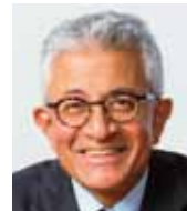
Valli Moosa Former Minister for Environmental Affairs and Tourism Republic of South Africa